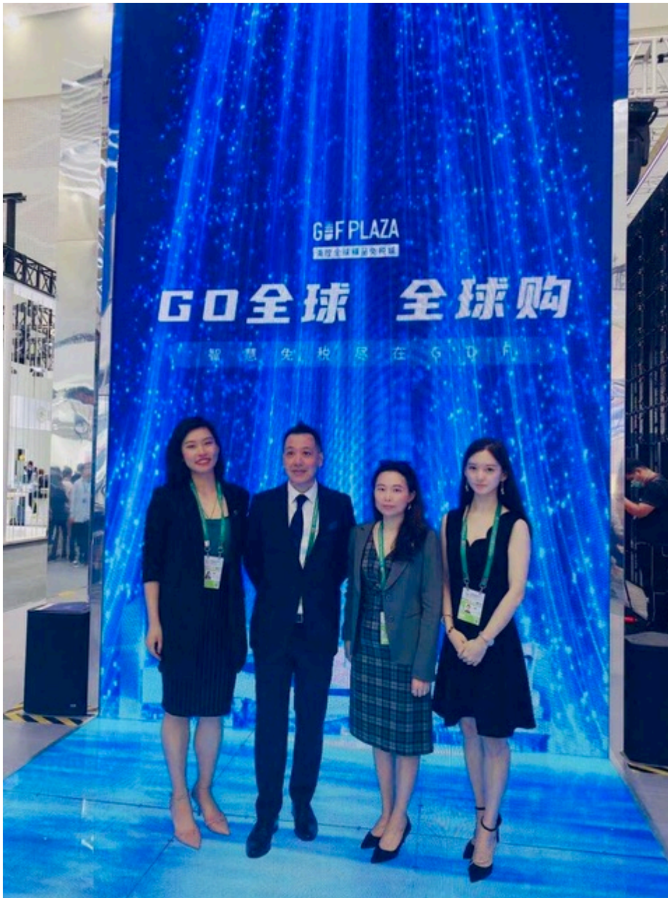
FOREO's travel retail team represented the brand in full force at the GDF Plaza