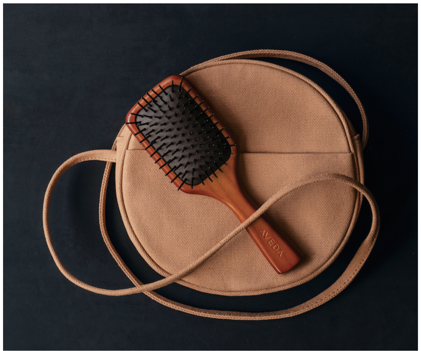
The Shilla Duty Free has brought the miniature version of the popular Aveda Paddle Brush to its counters at Singapore Changi Airport and Shilla stores in Korea