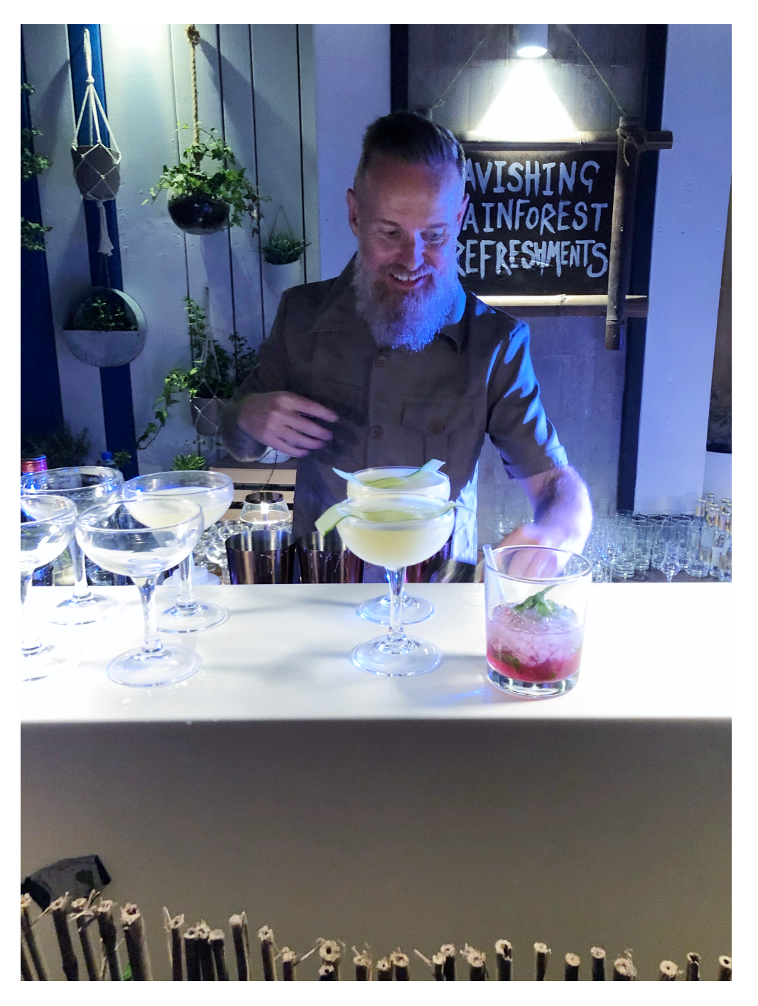
All 'Amazonian' greenery that brought this activation to life was rented for the celebration and will be returned to be replanted