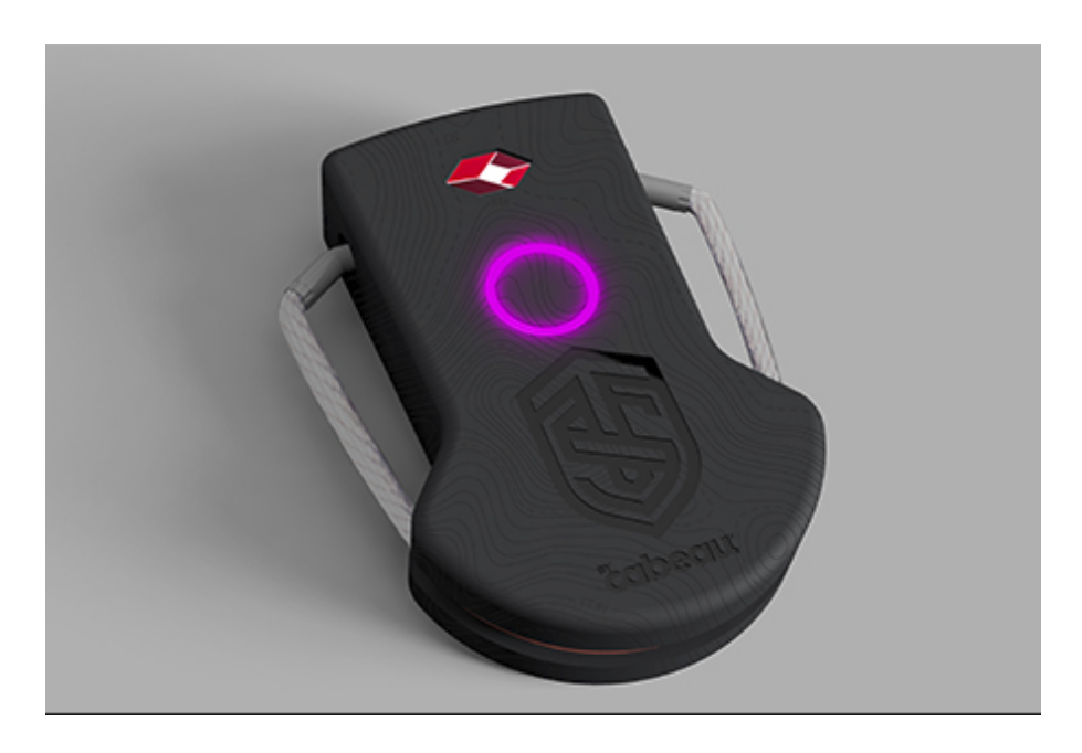
Track & Shield is Cabeau's first technology based tracking device that offers endless applications

"Track & Shield is the only device that provides real-time global tracking of anyone or anything," the company said. "It gives you the incredible ability to send a text message virtually anywhere, and geo-and time-stamps every time it's opened. Its applications are endless."