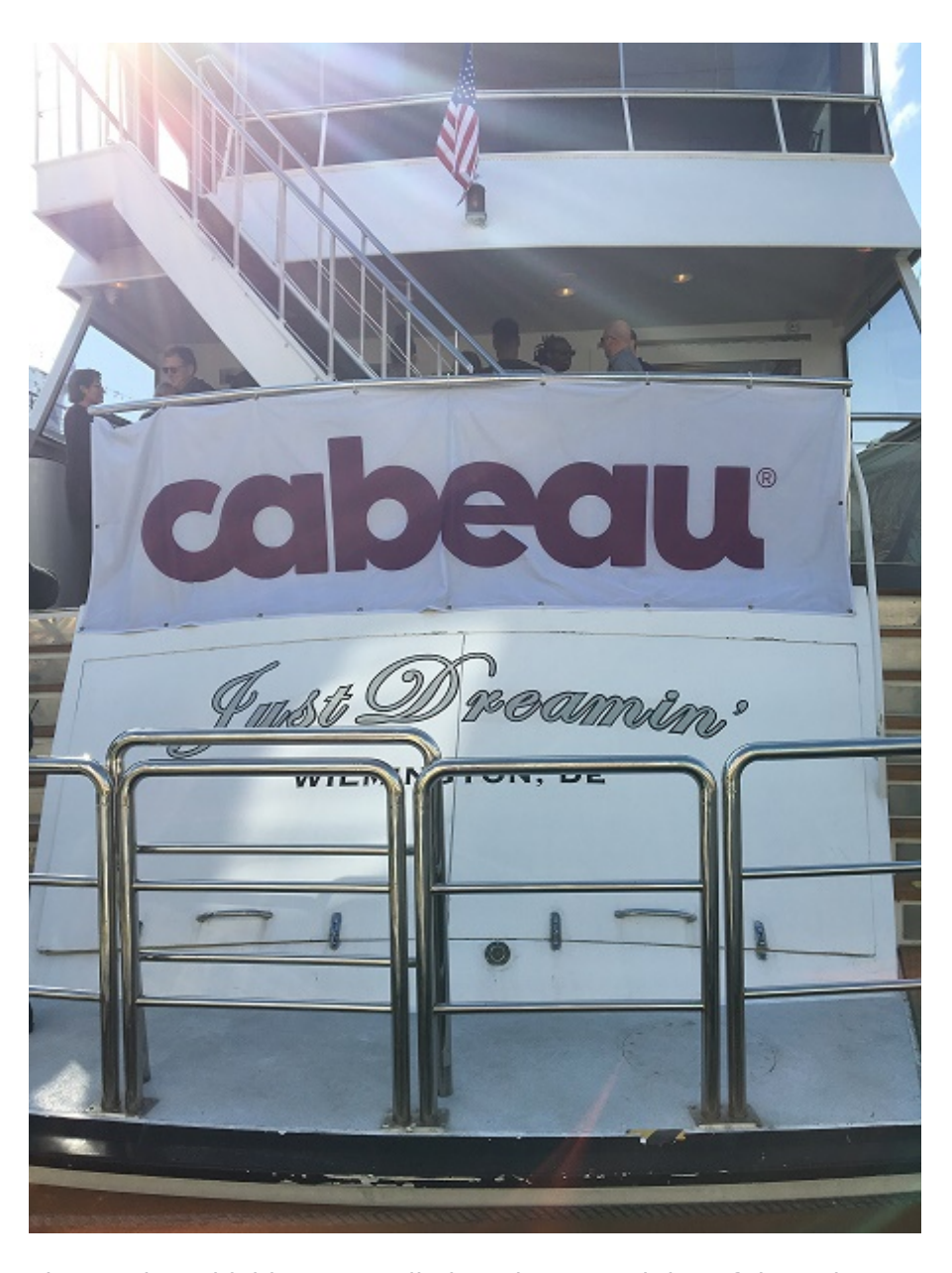
The Track & Shield was unveiled on the second day of the Cabeau Experience which included a yacht trip from Marina del Rey

The weekend-long Cabeau Experience, attended by business associates and the media – including Americas Duty Free – took in a cocktail party at the Erwin Hotel, Venice Beach; a yacht trip from Marina del Rey for the official product launch; and an evening at The Magic Castle, an exclusive, private club in LA.