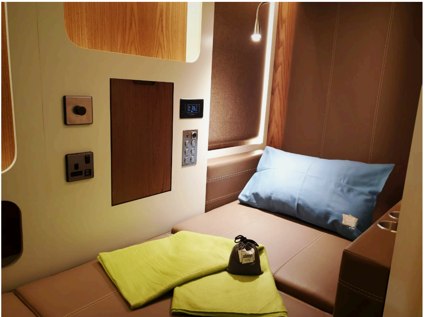
A snapshot of its FlexiSuite Pod offering, which represents the gold standard in sleeping pod design