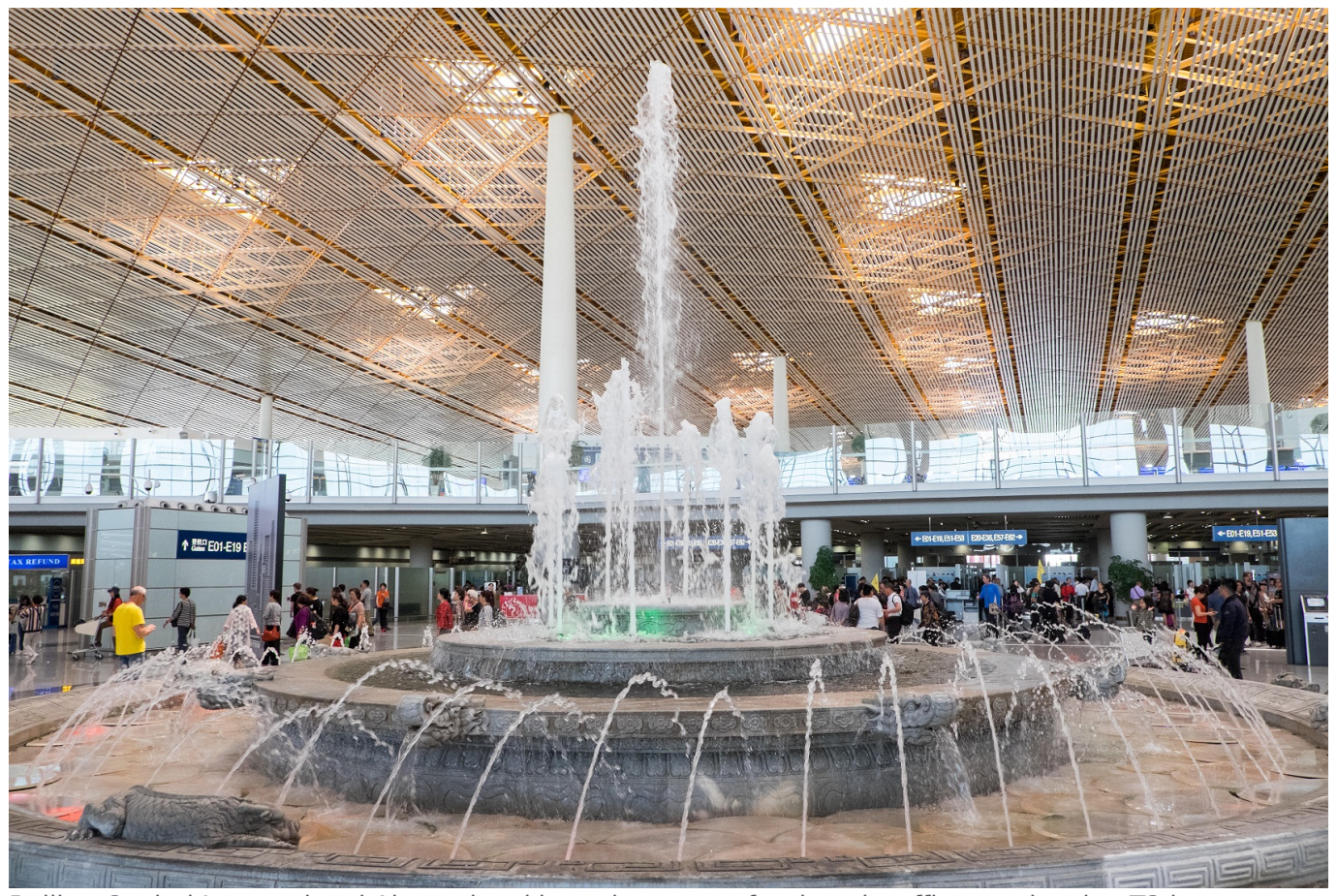
Beijing Capital International Airport is taking advantage of reduced traffic to redevelop T3 in partnership with The Design Solution

The Design Solution has been appointed by Beijing Capital International Airport (BCIA) to redevelop the commercial planning and design of the international departure lounge at Beijing Capital International Airport T3. Known as the second-largest terminal building in the world, BCIAT3, also known as the Dragon terminal, has been a symbol of innovation and growth of the Chinese travel market.