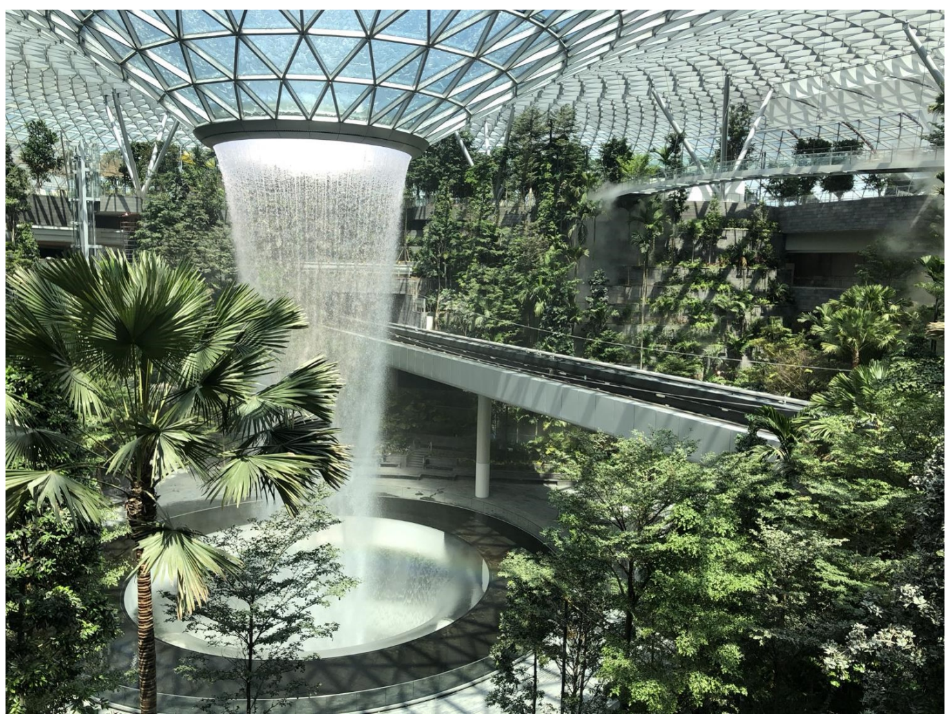
Visitors can get up close and personal with the majestic Rain Vortex in Jewel Changi Airport.