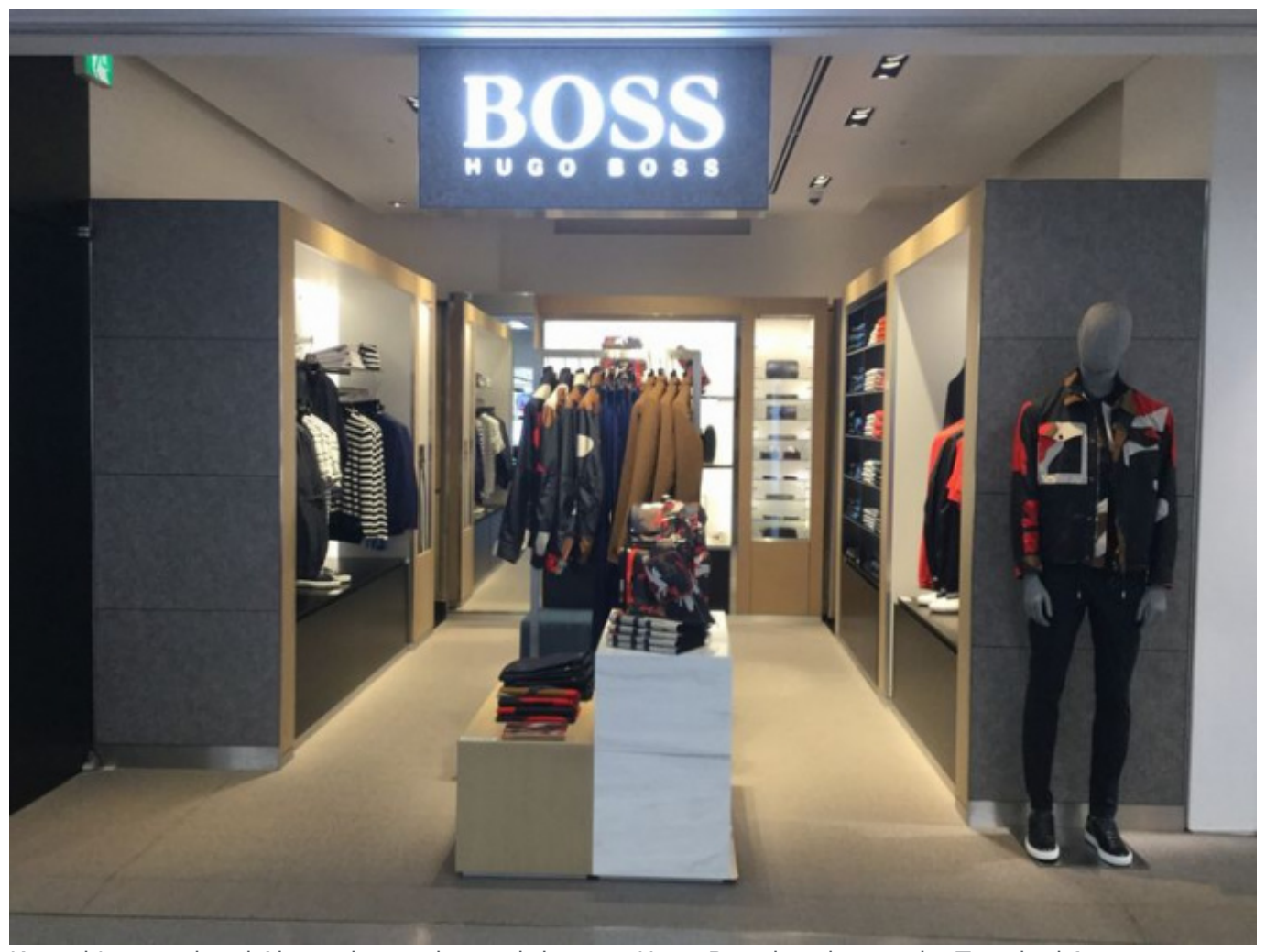
Kansai International Airport has welcomed the new Hugo Boss boutique at its Terminal 1

German lifestyle brand Hugo Boss has opened its boutique at Osaka's Kansai International Airport (KIX) Terminal 1 on March 11, 2020.