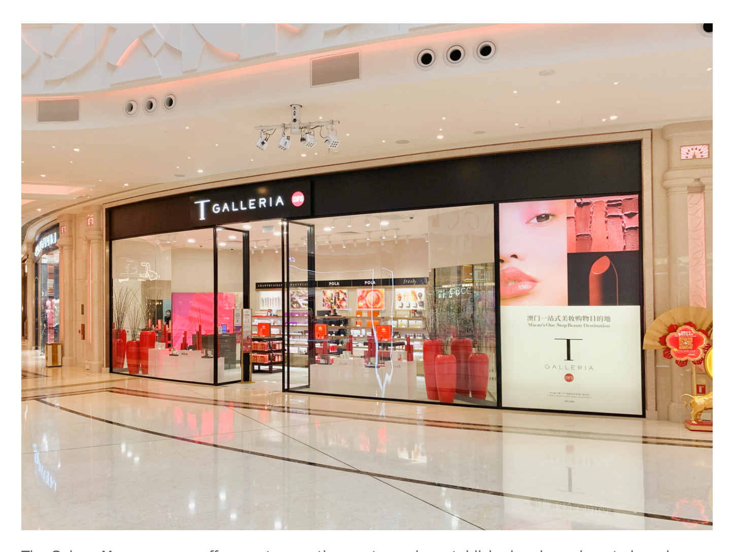
The Galaxy Macau pop-up offers customers the most popular established and new beauty brands

The third pop-up, located within the StarWorld hotel, offers an exclusive shopping experience for Galaxy Entertainment Group's Privilege Club members. Here customers can find the most soughtafter beauty items as well as small leather goods from the top luxury brands.