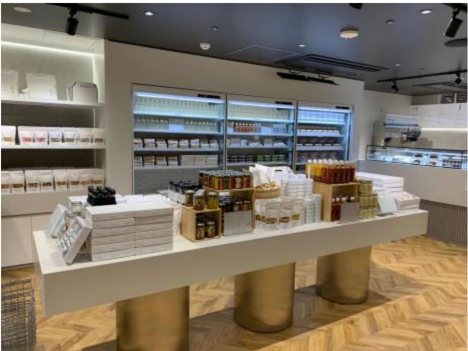
Lagardère's entry into the Japanese market "Made in Pierre Hermé," will open up opportunities the country over