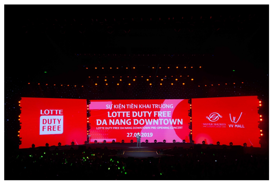
Lotte Duty Free has kickstarted its Da Nang downtown store pre-opening publicity with a concert at the Tien Son Sports Palace in Da Nang

Lotte Phu Khanh Duty Free organized a pre-opening concert for its upcoming Da Nang downtown store at Tien Son Sports Palace in Da Nang on August 27. Lotte Phu Khanh Duty Free is the name of Lotte Duty Free Vietnam Corporation. Lotte's Da Nang store, which is its fourth store in Vietnam, will be opened by this year. The store will also be the first downtown duty-free shop in the central coast of Vietnam.